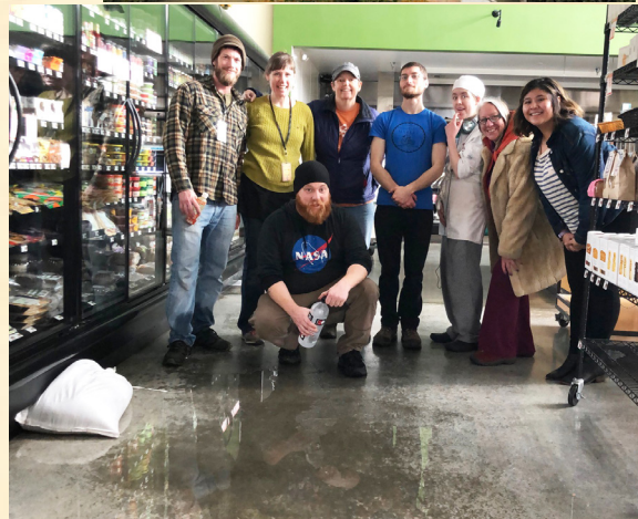
Our CM Water Crew in SEB