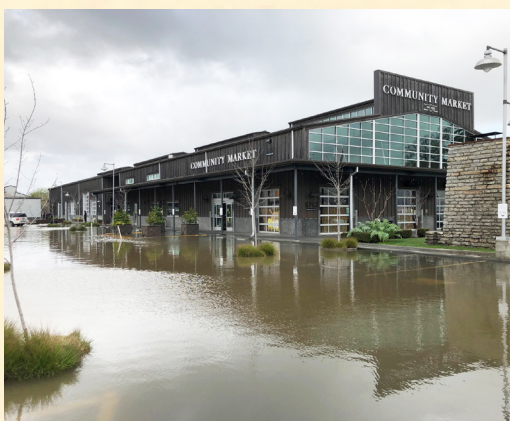
Front of our CM Store 2/27/19

This is Sebastopol, not Venice. The left picture is outside the back of our CM store. The cement area on the left is our loading dock.