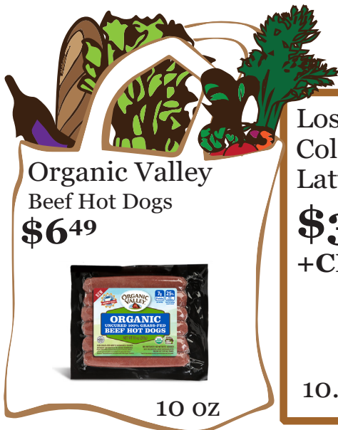
Organic Valley Beef Hot Dogs $6 49